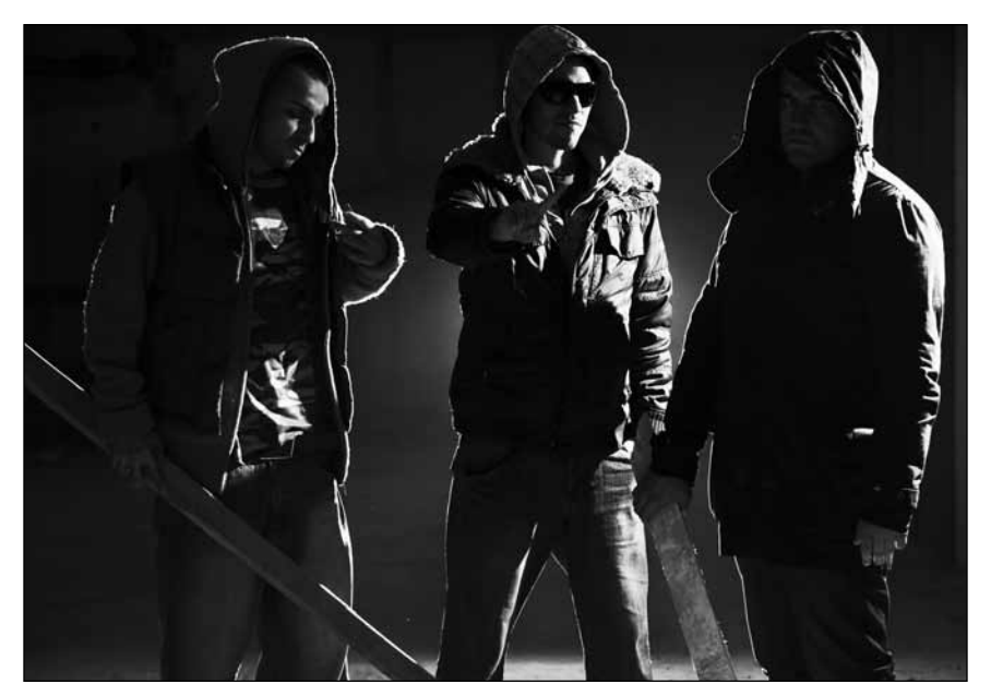
An argument that disparity of force existed may be used when multiple assailants attack.

Legally speaking, likely it was lawful for the defender to use force in self defense, but in court the claim is made that he or she used excessive force. Under these circumstances, the defendant will need to show the jury, or a judge if the case is