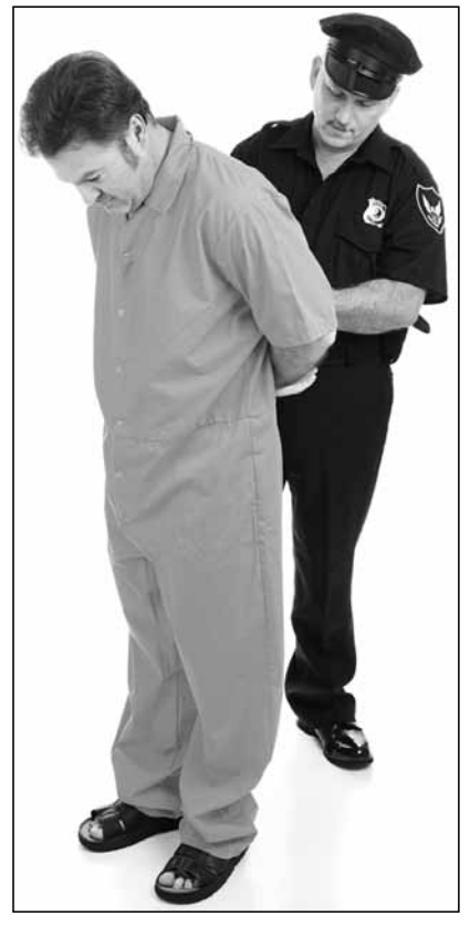
You could be arrested for assault with a deadly weapon after defending the wrong person.

holding at gunpoint? Depending on locale, this would likely be prosecuted as a case of second degree assault or assault with a deadly weapon, because the guy