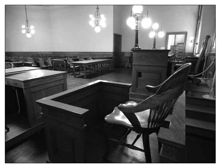
Sitting in the witness' chair and at the defendant's table in a courtroom is one of the possible outcomes of being involved in a self-defense shooting.

These are only some of the reasons gun owners must understand when it is justifiable to use deadly force in self defense, as well as learning what to expect from the legal system if they are left with no viable alternatives and must shoot an attacker.